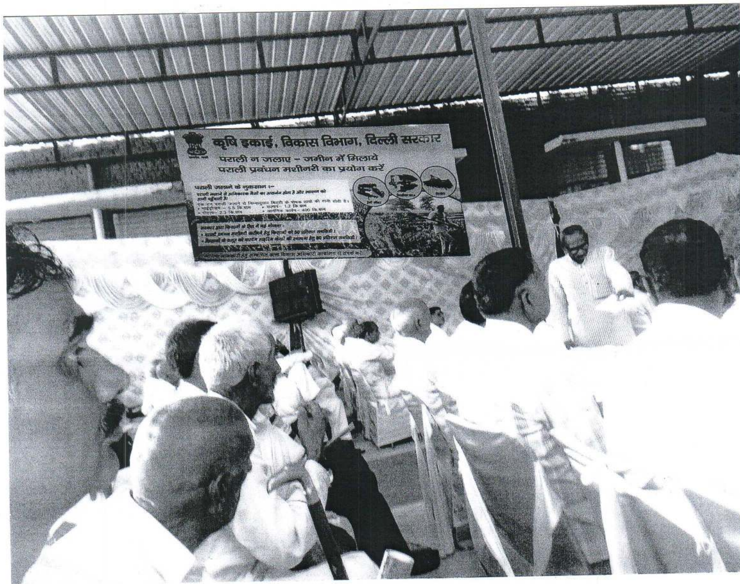
Village-Sikarpur, Distt.-South-West, Date-27/11/2019