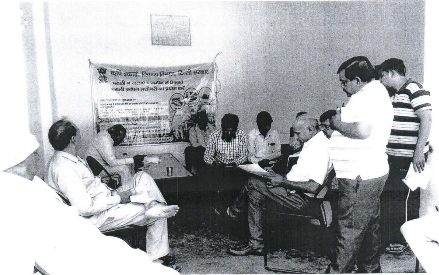
Village-Jhatikra, Distt.-South-West, Date-20/11/2019