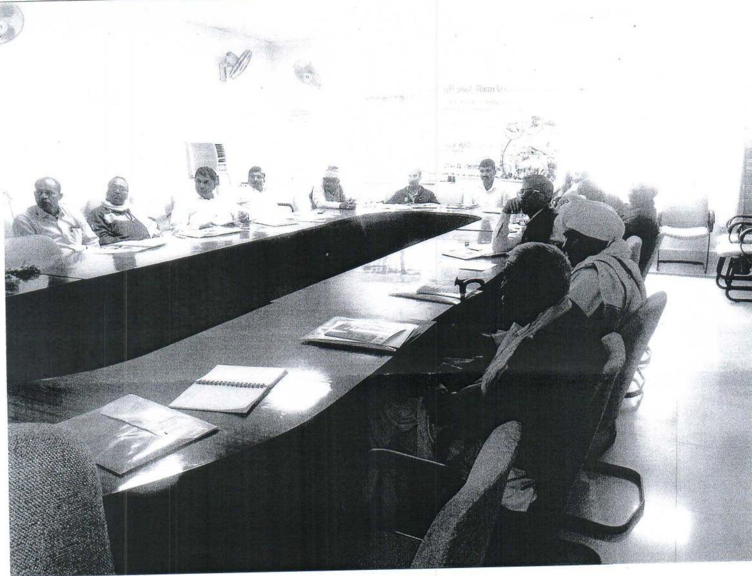
Village-Mohammad Pur, Distt.-North, Date-29/11/2019