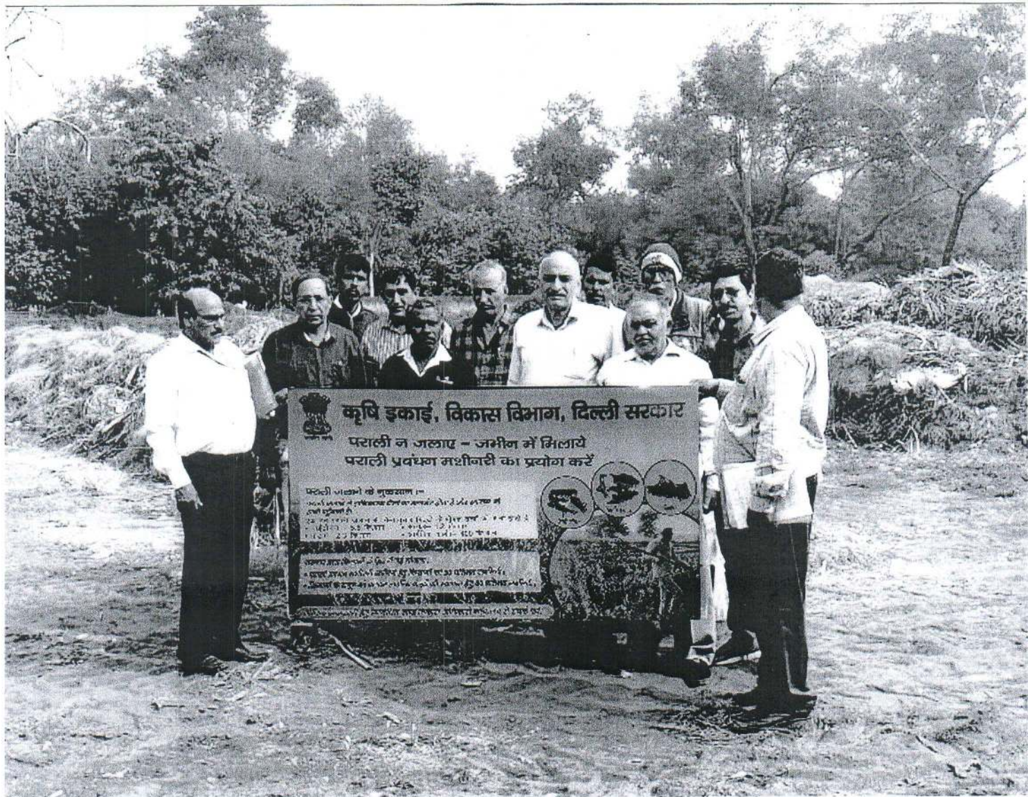
Village – Badu Sarai & Jheel, Distt. – South-West and East, Date-11/11/2019