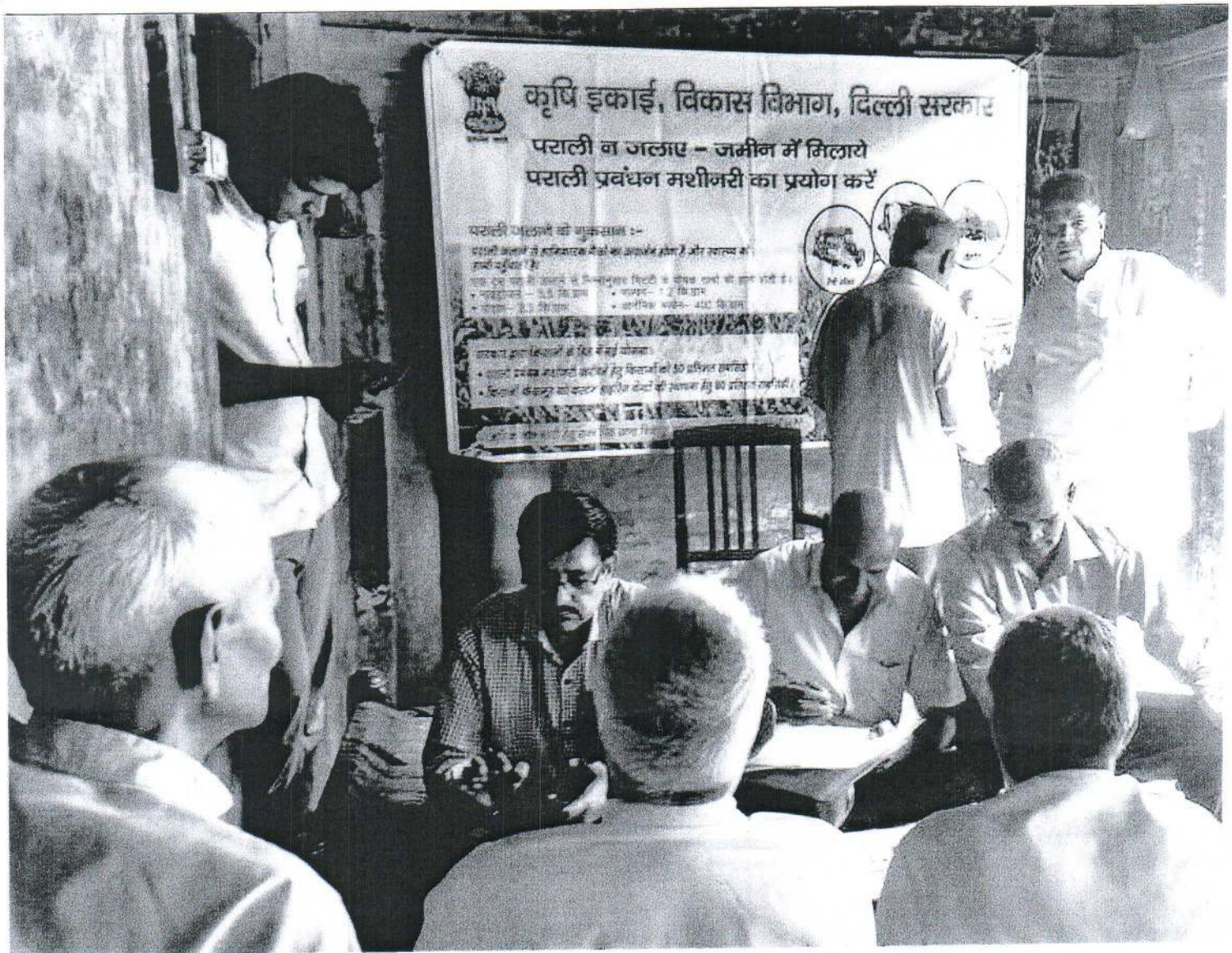
Village-Bankner, Distt.-North, Date-08/11/2019