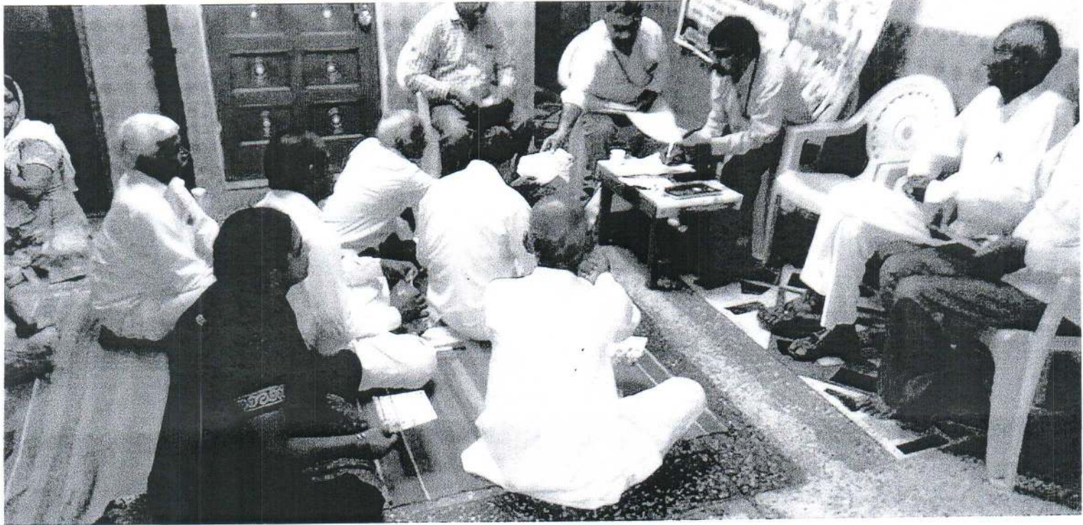
Village-Bakhtawerpur, Distt.-North, Date-18/11/2019