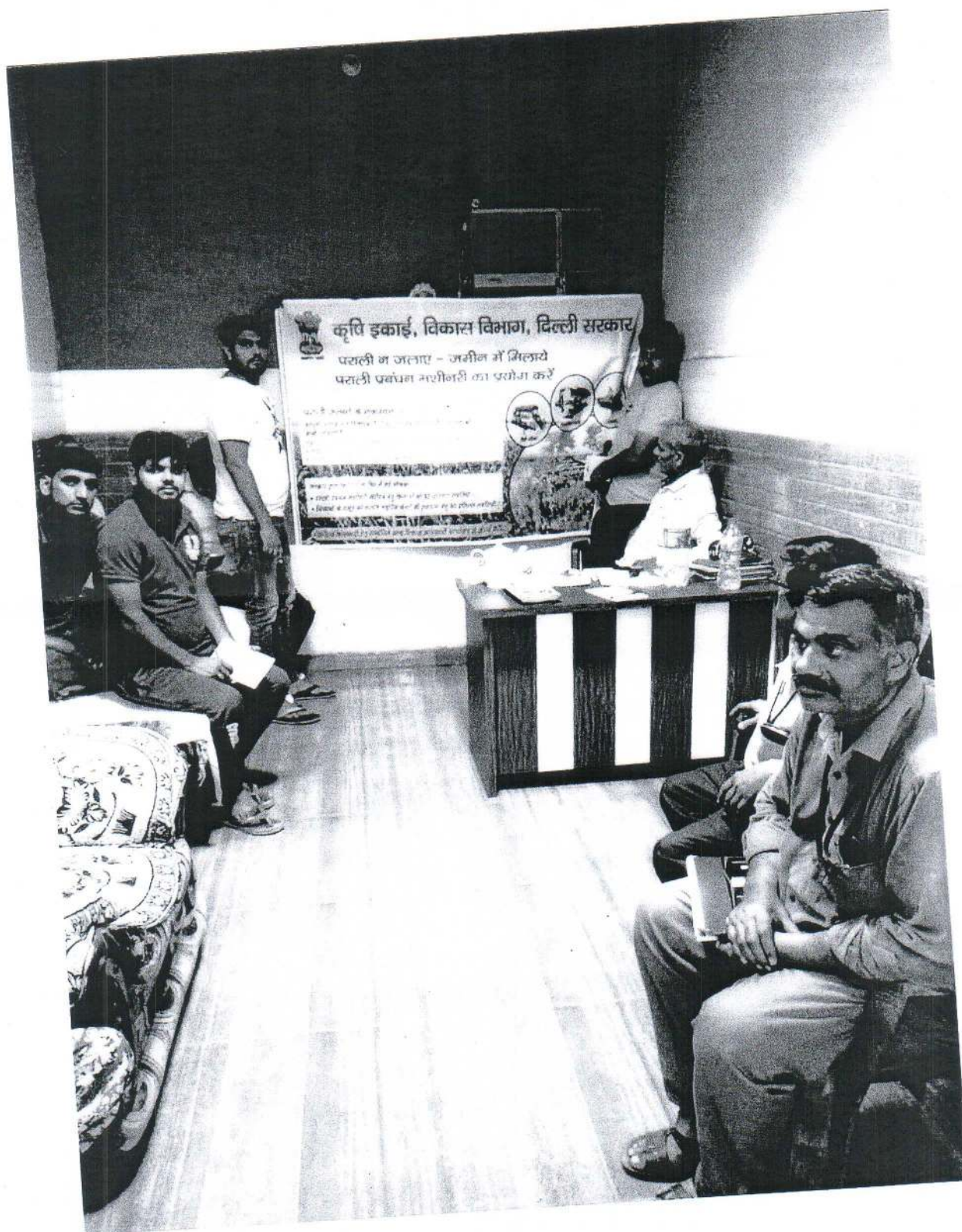
Village-Kangan Heri, Distt.-South-West, Date-27/11/2019