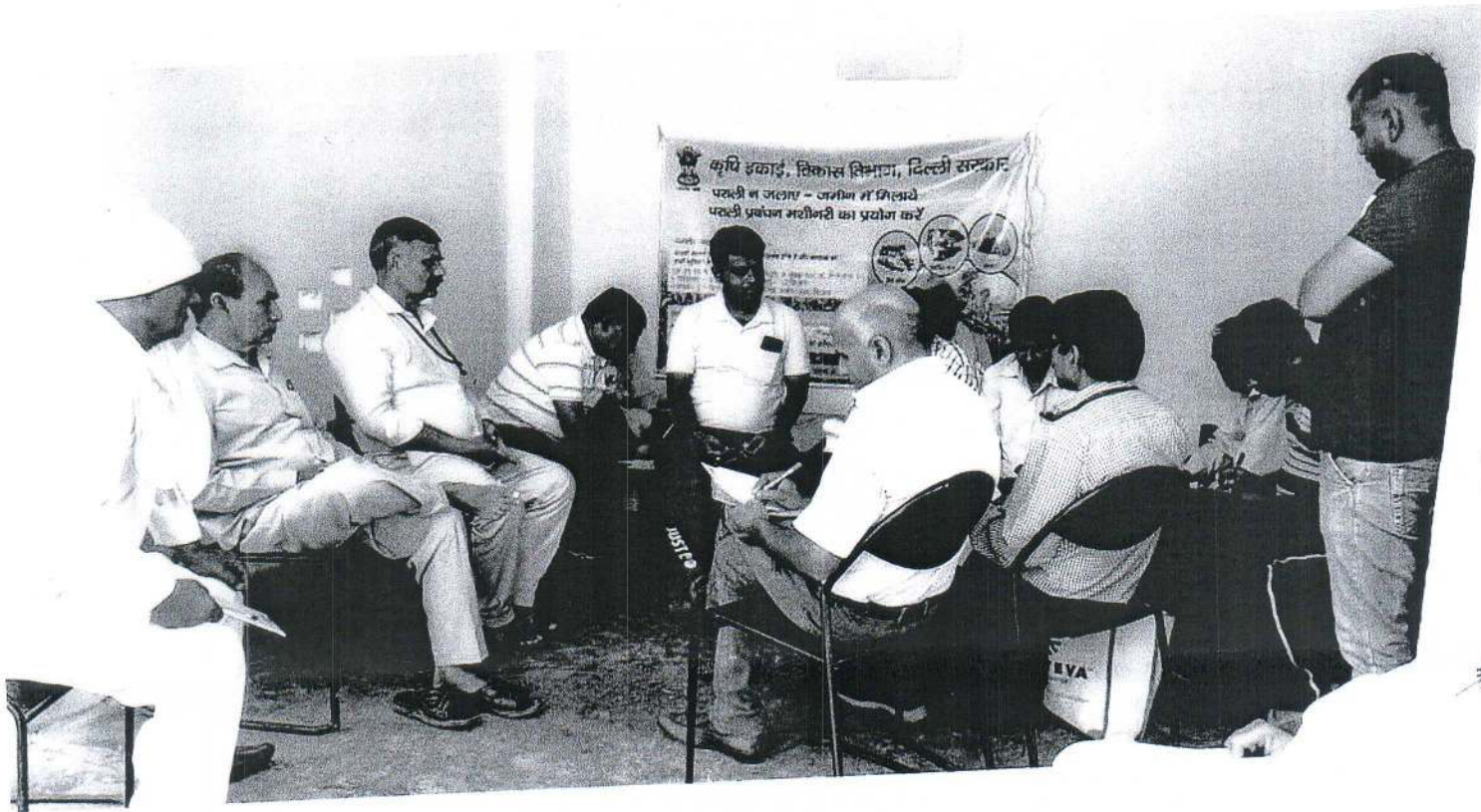
Village-Mohammad Pur, Distt.-North, Date-27/11/2019