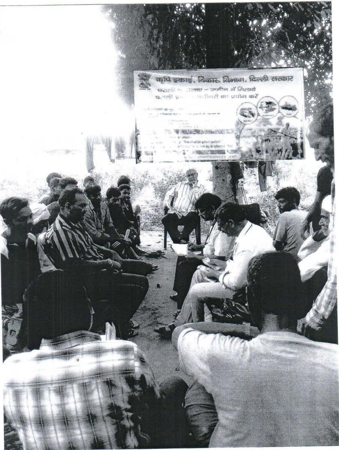
Village-Neelwal, Distt.-West, Date-21/11/2019