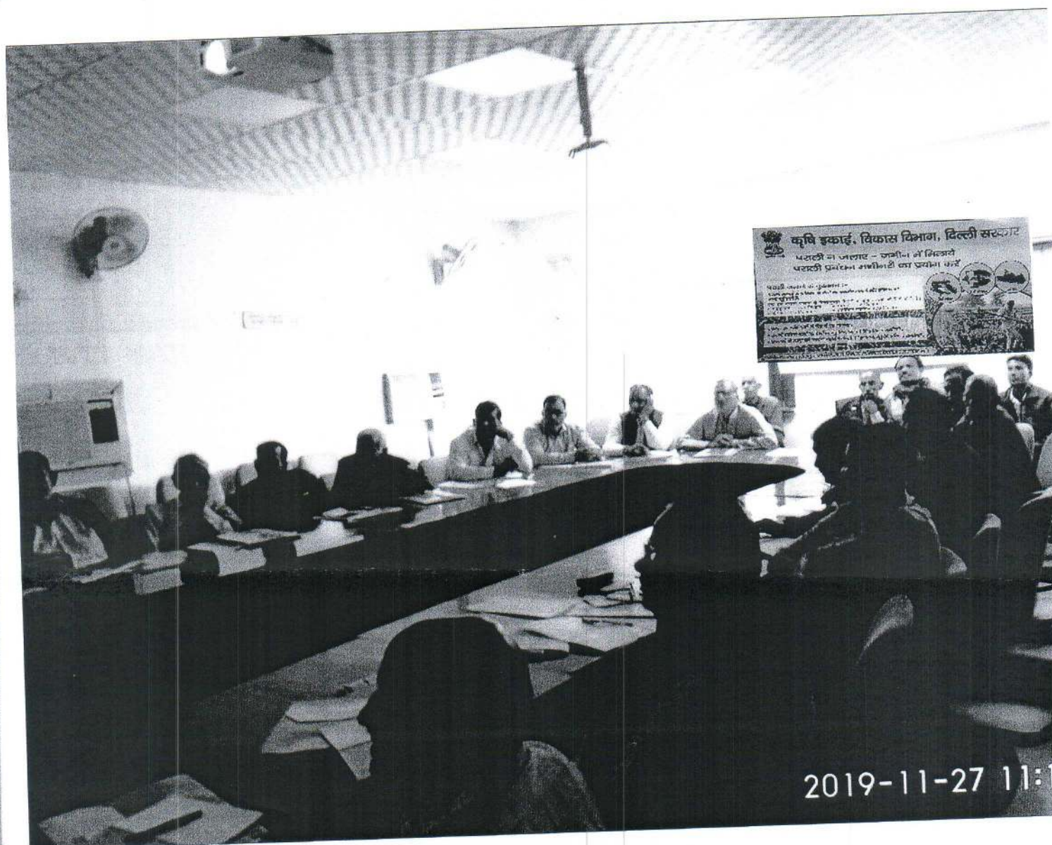
Village-Jonti, Distt.-North-West, Date-27/11/2019