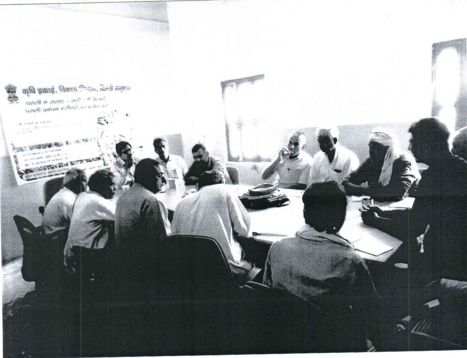
Village-Mithraon, Distt.-South-West, Date-26/11/2019